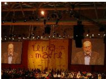
Terra Madre 2006, Turin (Italy)

promising place in the market, with the appropriate intellectual property rights to protect them from abuses in a more and more globalized world. The benefits of GI protection are often undermined by firms that abuse and free-ride on the reputation of famous local products. This conduct not only has devastating effects over producers who work very hard to maintain a high level of quality while preserving the local savoir-faire, but also misleads the consumers as to the origin of the goods. OriGIn believes that an improvement of geographical indications' protection will ensure an adequate protection of quality and traditional products that is to the benefit of both consumers and local communities; otherwise, without strong GI protection, the future of geographical indications is in jeopardy!