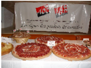
Tasting session of GI products during the Extraordinary General Assembly of OriGIn

better GI protection at all levels, learning from outstanding examples such as the Shanxi Apples from China, the Argan Oil from Morocco or the Colombian Coffee, among others.