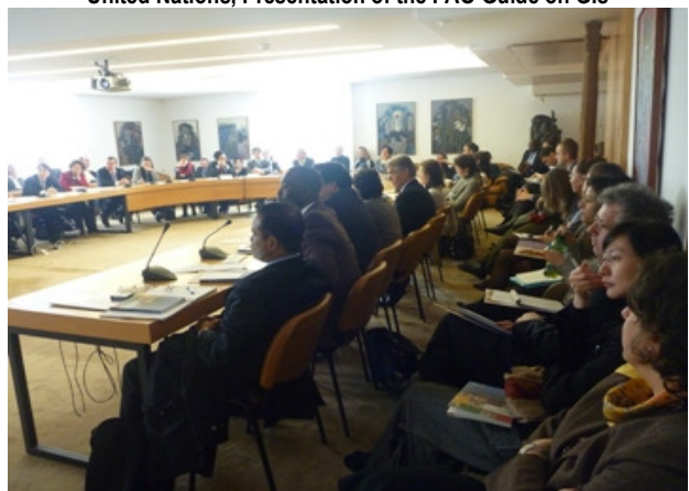
18 February, UN, Geneva (Switzerland)

United Nations, Presentation of the FAO Guide on GIs