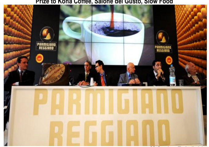
23 October, Turin (Italy)

Prize to Kona Coffee, Salone del Gusto, Slow Food