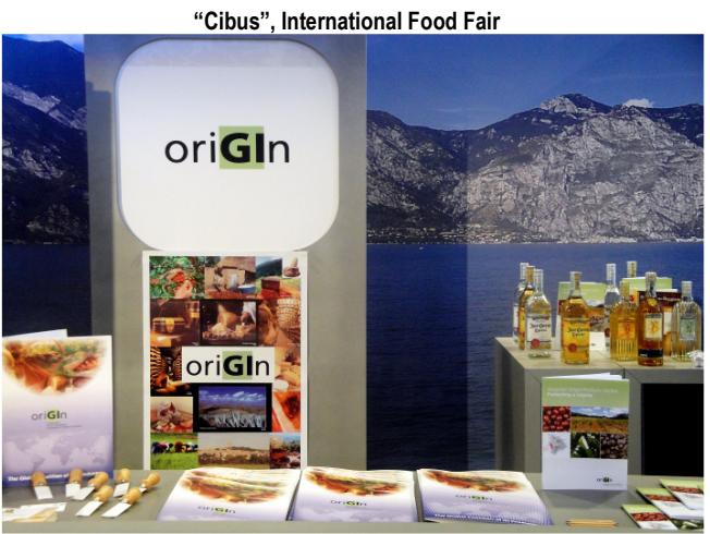
10-13 May, Parma (Italy)

Prize to Kona Coffee, Salone del Gusto, Slow Food