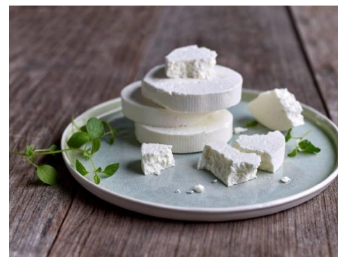
Mavroupi / Manouri PDO (EL)