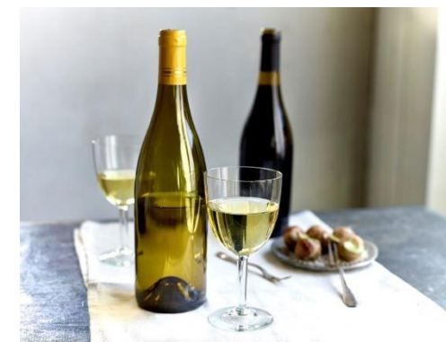
Bourgogne PDO (FR)