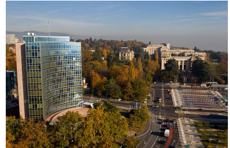
World Intellectual Property Organization