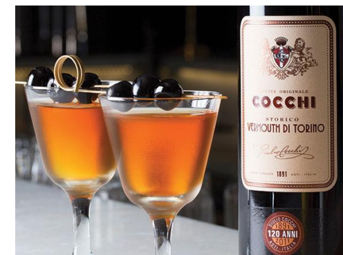
Vermouth di Torino GI (IT)