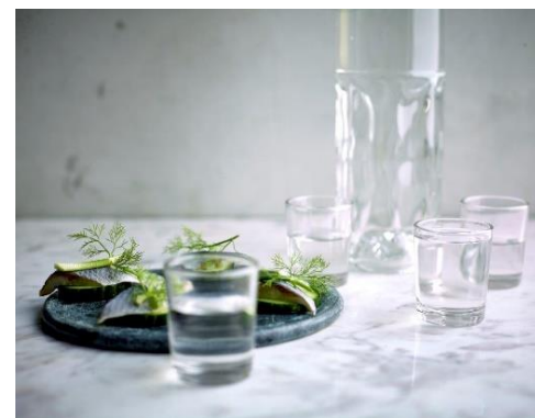
Suomalainen Vodka / Finsk Vodka / Vodka of Finland GI (FI)